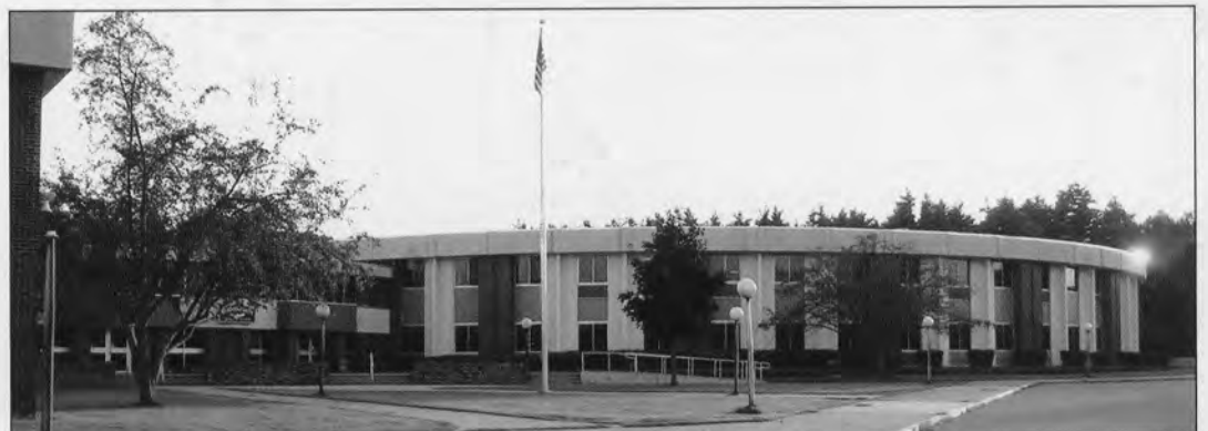
Farnsworth Middle School

None of these districts operates a school facility within the Town of Guilderland.