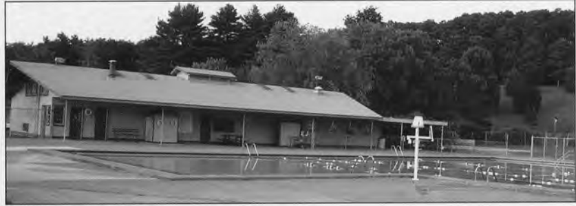
Tawasentha Park Public Pool

Tawasentha Park on Route 146, together with the adjoining Winter Recreation Area, is the centerpiece of the parks