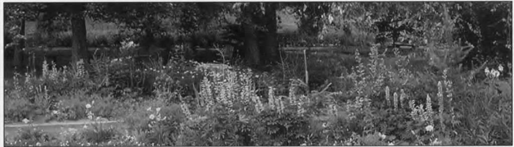
Tawasentha Park Gardens

from "Town of Guilderland 2001 Comprehensive Plan"