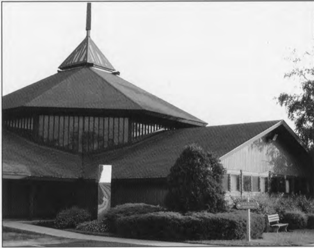
Lynnwood Reformed Church