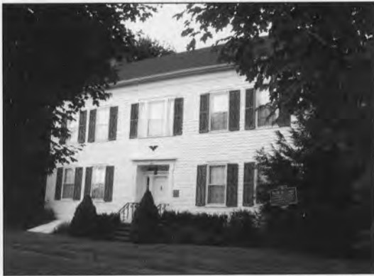
Frederick House Historical Site