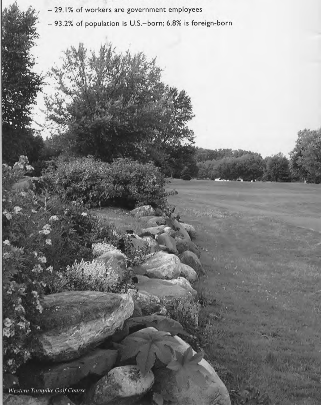
Western Turnpike Golf Course

Guilderland has evolved into a thriving community with a mixture of residential and commercial areas and a 2000 population of over 34,000 residents. The Town's land area of over 58 square miles includes farmland, open space, varied residential neighborhoods, and a broad spectrum of commercial uses, including manufacturing, offices, research facilities, and an array of stores, professional, and service businesses.