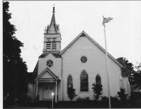
Altamont Reformed Church