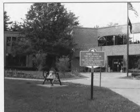
Guilderland Town Hall