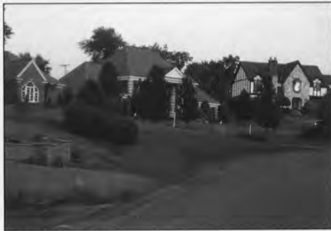
A Guilderland Streetscape