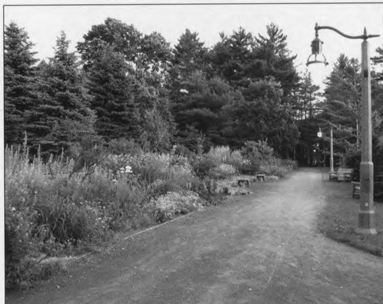
Pathway, Tawasentha Park