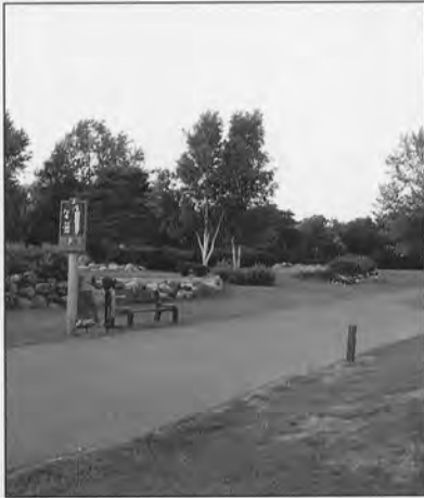
Western Turnpike Golf Course

system. The swimming pool area includes diving, lap area, kiddy pool, changing area, and concession stand. Swimming classes for all age and skill levels are offered each summer, and the Guilderland Parks Department operates the popular Day Camp and Sports Camp programs from Tawasentha each summer. Day Camp programs include swimming and arts and crafts. Sports Camp offerings include golf, soccer, softball, tennis, football, wrestling, gymnastics, and archery.