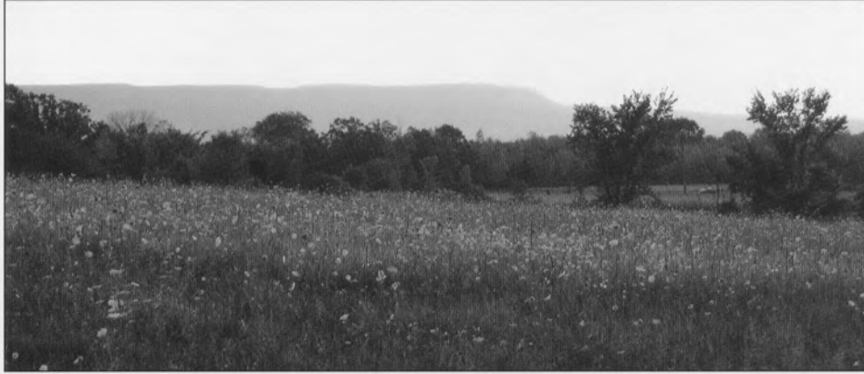
The Helderberg Escarpment