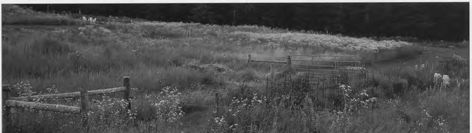
Guilderland Community Gardens

The Guilderland Parks Department also operates the Community Gardens on Route 146 where Town residents can obtain free use of garden plots.