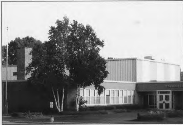
Lynwood Elementary School

The Guilderland Central School District was created in 1950 through the consolidation of ten smaller districts. The School District is an entity separate from and independent of the Town of Guilderland. It is governed by an elected nine-member School Board, and funds its operations through its own property tax levy, state aid, and other sources of income. Questions regarding the District may be directed to its Administrative Offices, 6076 State Farm Road, Guilderland, NY 12084 (456-6200).