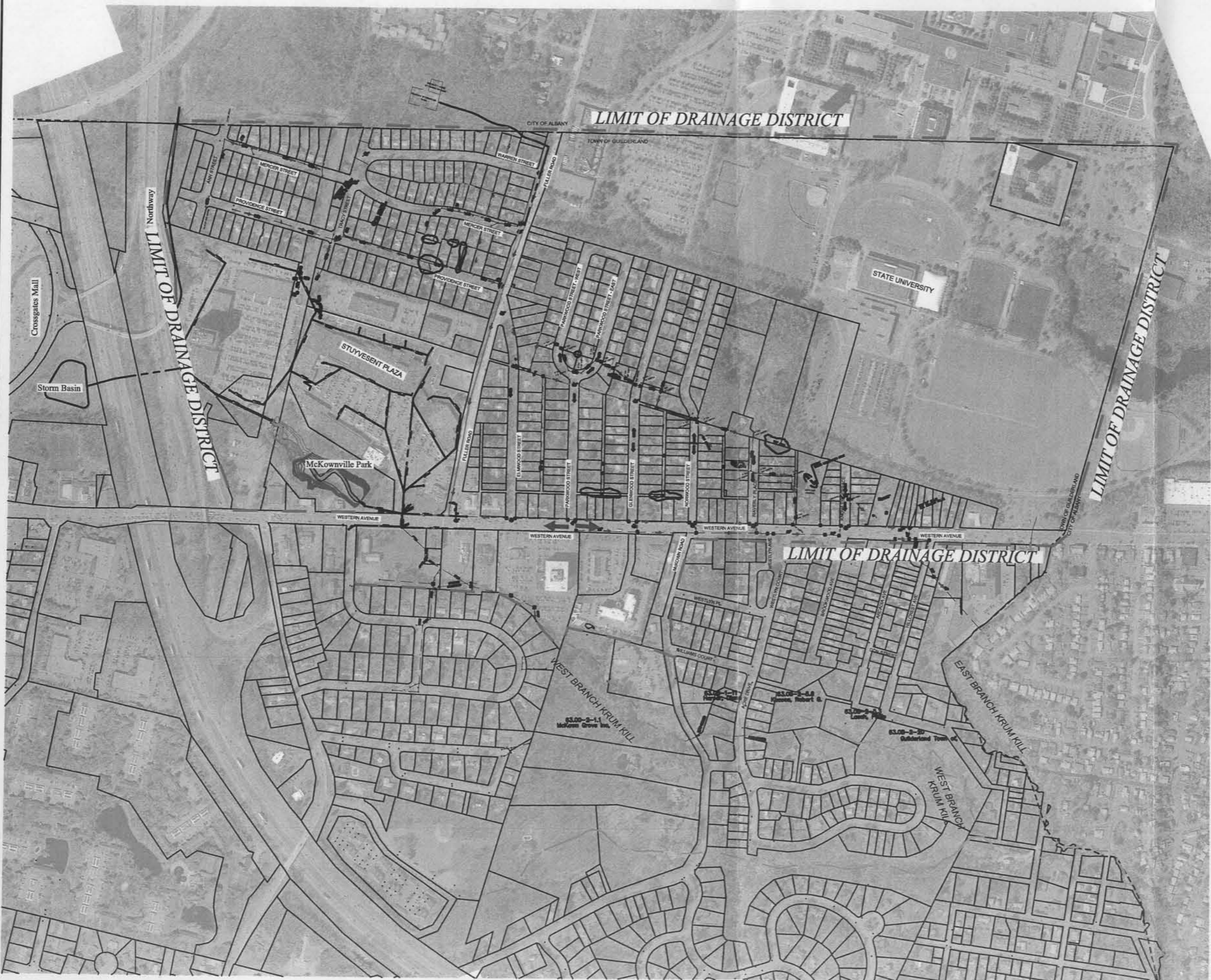
EXISTING CONDITIONS MAP

DATE: JAN. 2013 DRAWN BY: SCALE: REVIEWED BY: PROJECT NO.: FILE: