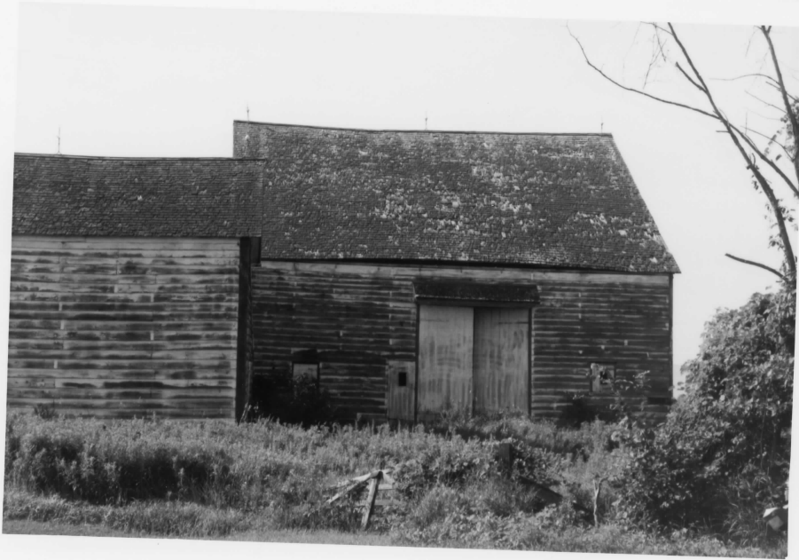
Detail of side of Dutch Barn