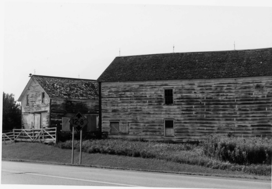
View of contributing English Barns