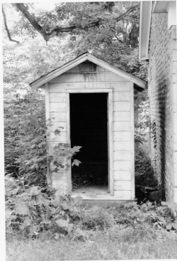
Original school privy on north side