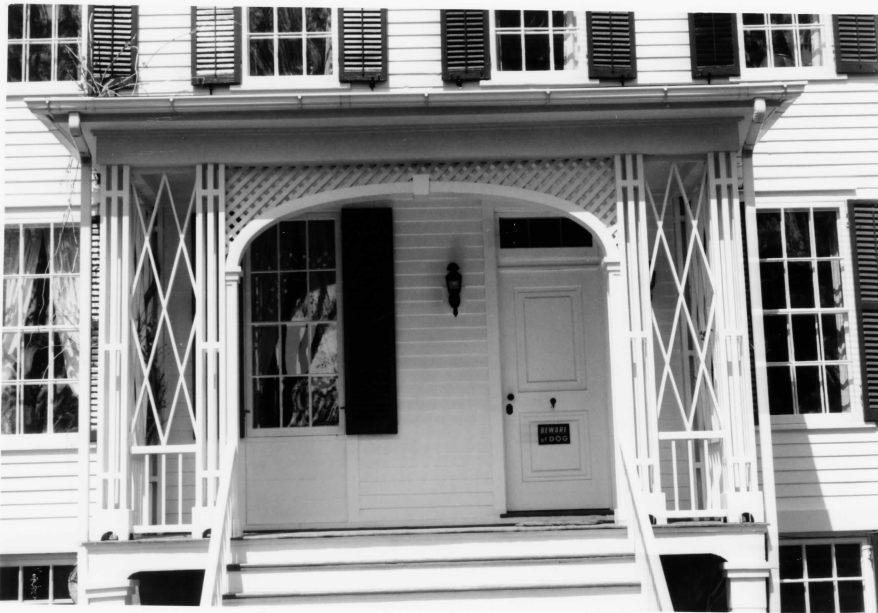
Detail of front porch