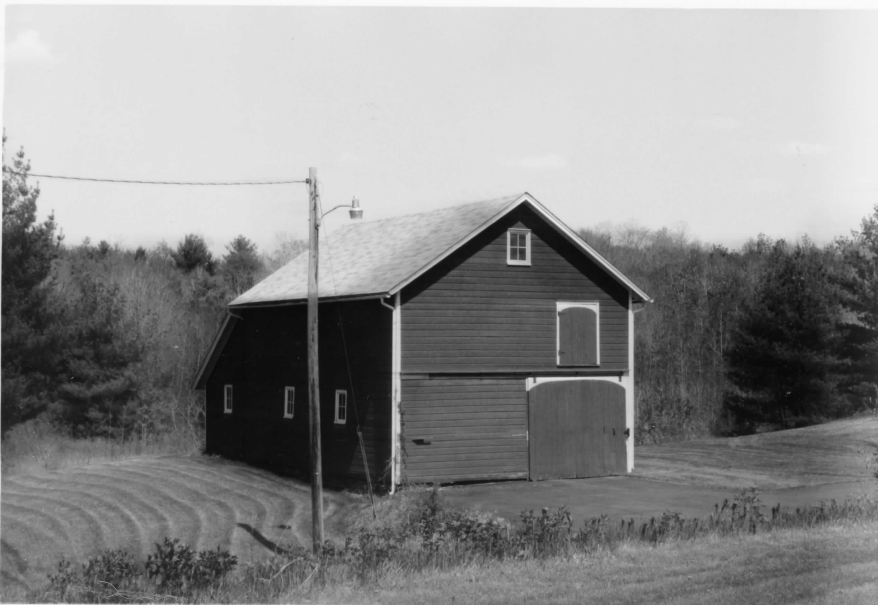
Barn located northeast of the house