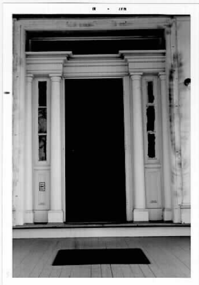
Detail of Classical front door