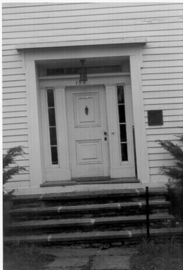
Detail of front door