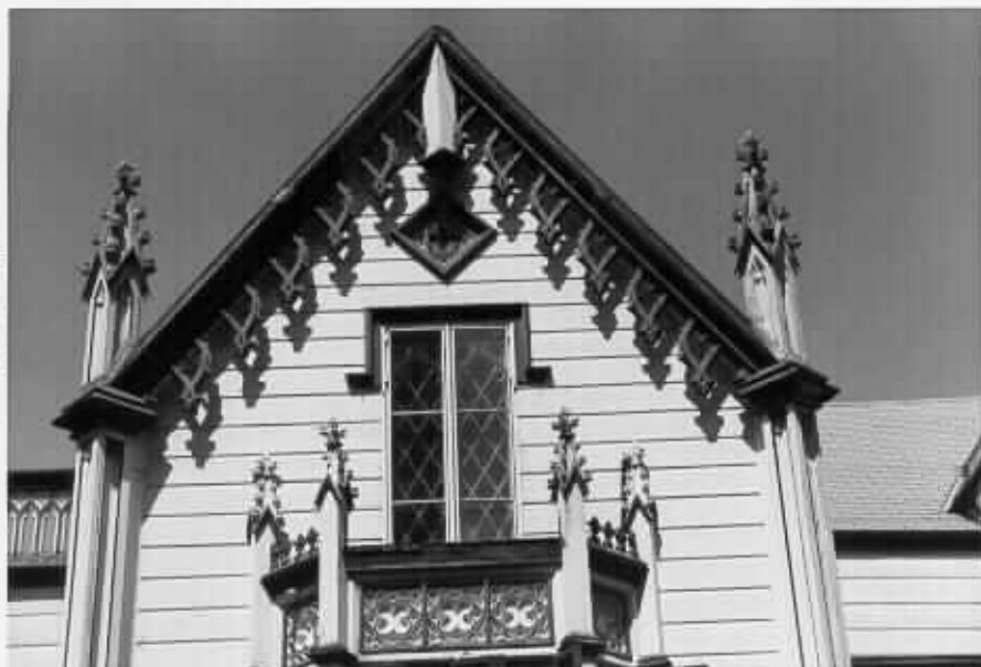
Detail of gable end on southern elevati