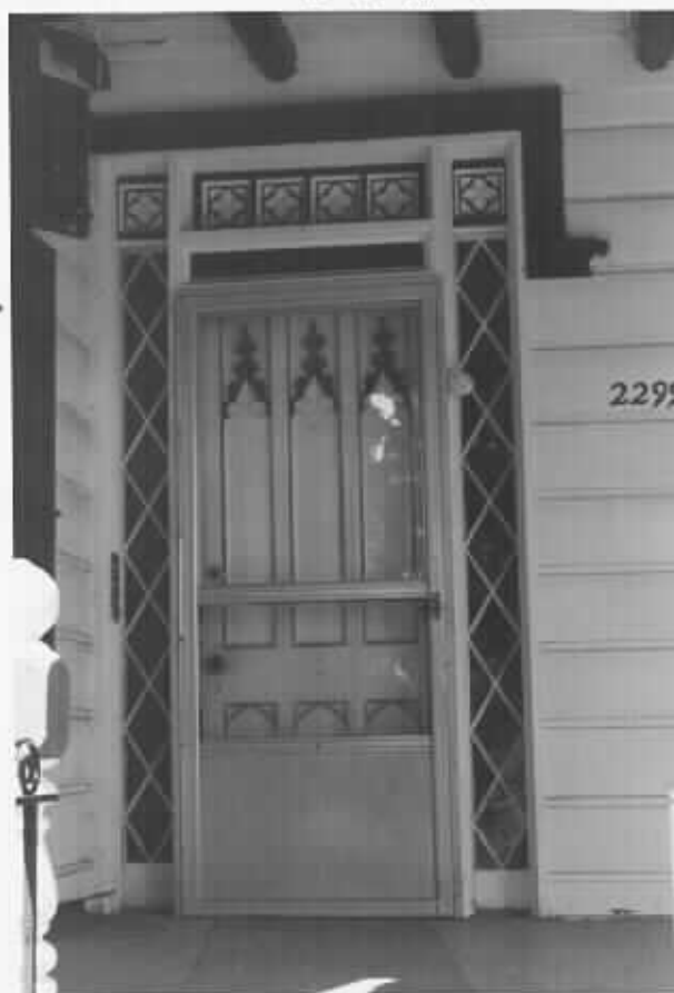
Detail of front door