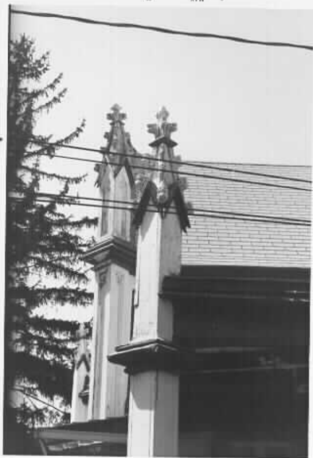
Detail of pinnacle with crockets