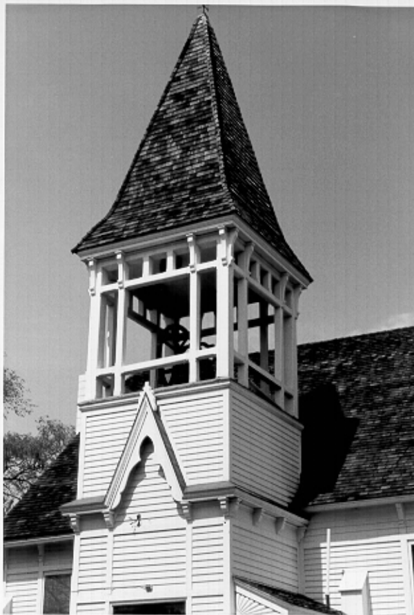
Historic Resources of Guilderland (Phase 1) Guilderland, New York Albany County

Building #5 HAMILTON UNION PRESBYTERIAN CHURCH