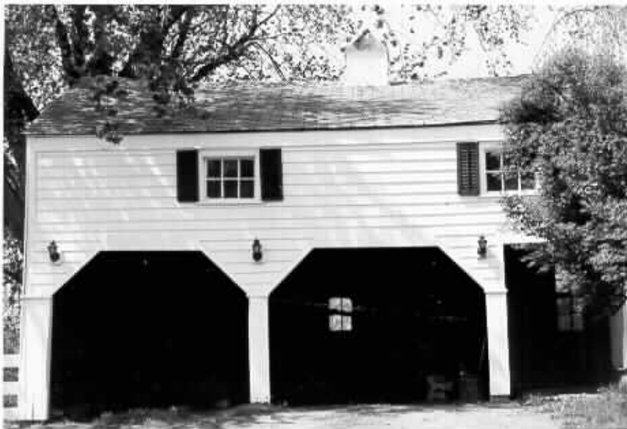
Carriage shed, southern elevation