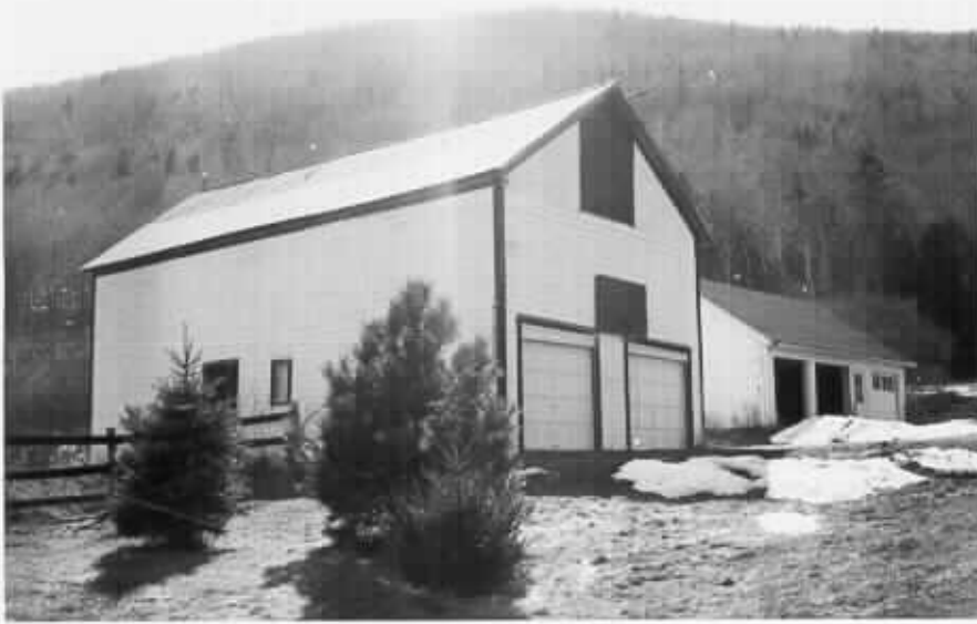
Barns & garages southeast of property

East of property looking east, showing original section