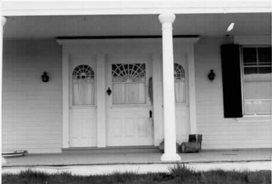
Detail of front door (east elevation)