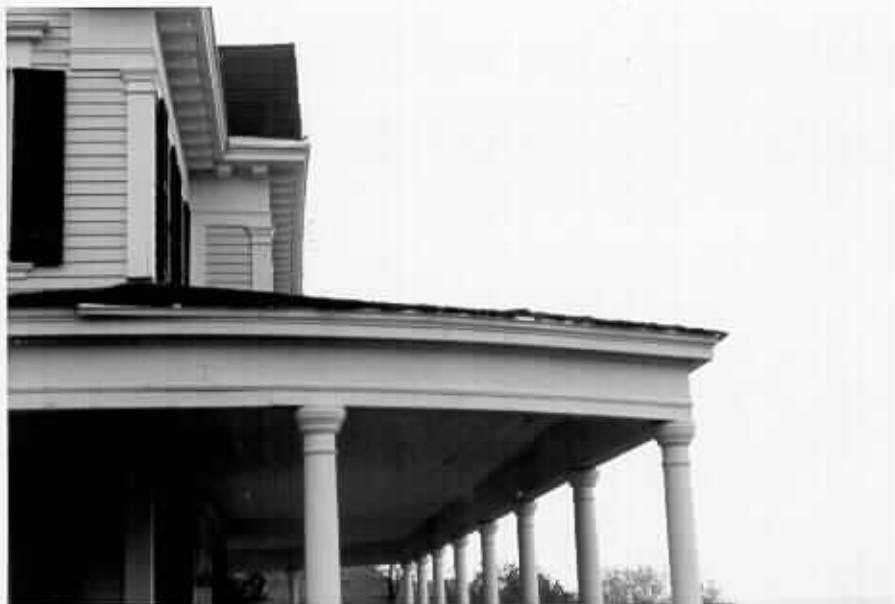
Detail of front porch (east elevation)