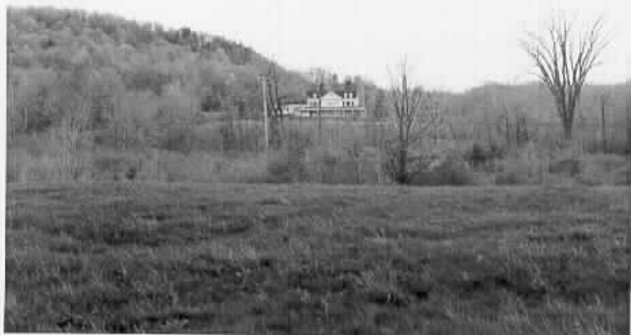
Looking west from Leesome Lane

Coppola Residence (Bldg. #34) Guilderland, NY Albany Co., NY