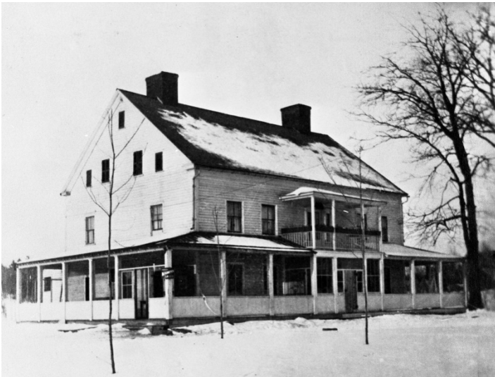
McKown Tavern c.1916, one year before it burned down