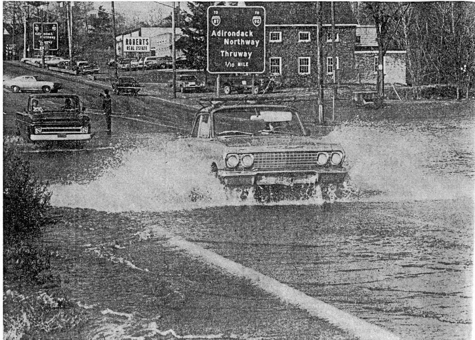
Automobile makes its way on flooded Western Ave. (Route 20) in Guilderland.