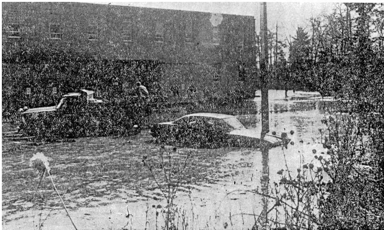
A Stuyvesant Plaza truck plows through the flooded parking lot as water partially engulfs one car.