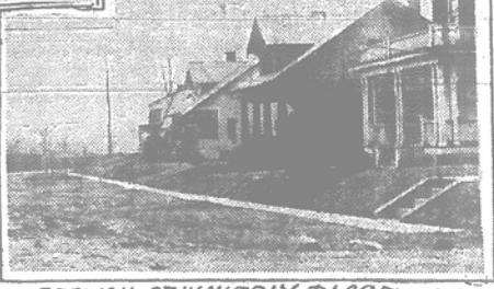
SECTION OF WAVERLY PLACE